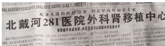
Advertisement for Kidney Transplant at Air Force 281 Hospital in Beidaihe District, Qinhuangdao City

(Clearwisdom.net) There have been questionable kidney transplant operations conducted at the Air Force 281 Hospital in Beidaihe District, Qinhuangdao City. The hospital is now preparing to do combined liver-kidney transplants, and is advertising in local newspapers (see photo). The contact information in the newspaper lists phone # 86-335-5360301, for Yang Guangting and Feng Binggang.